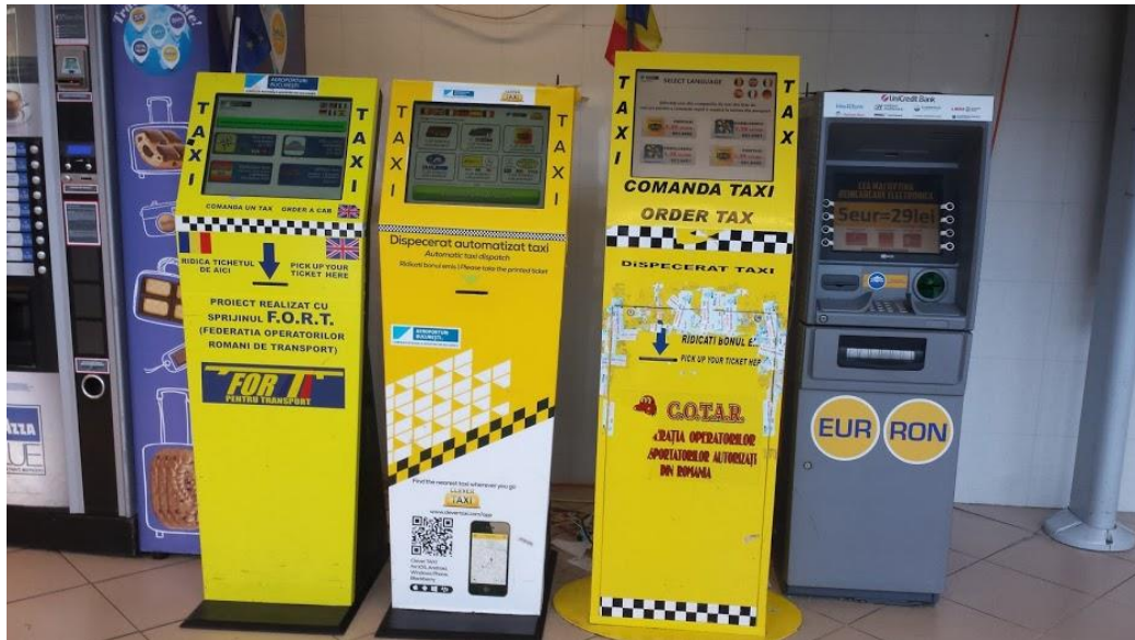
Touch-screen terminals for taxi ordering