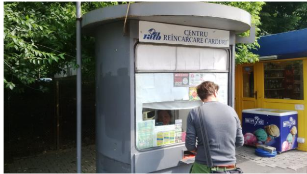
Kiosk for bus/tram tickets

Subway ticket: can be bought from every subway station for 5 RON 2 way-ticket. (about 1,1€).